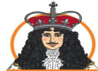
King Charles II